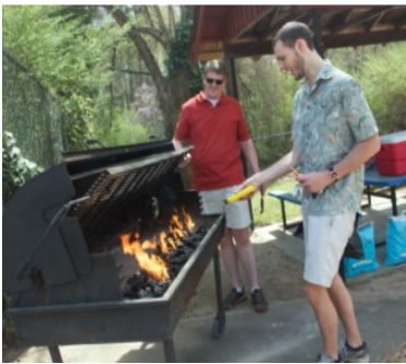
SPS organizes picnic every year at the Camp Creek, GSU. This picture shows an instance of this year's picnic: grilling and exchanging ideas.