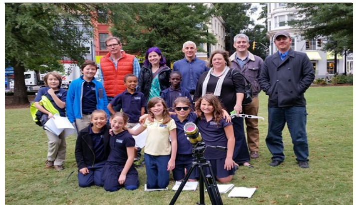
Students from Riverstone Montessori Academy visited the Department on October 16th to get help from professional astronomers in constructing a scale model of the Solar System. Fortunately the clouds parted enough that day to also allow everyone to view the Sun with our solar telescope in Woodruff Park.