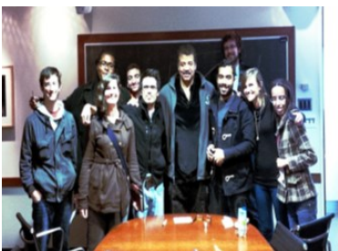
Astronomy Club members with Dr. Neil deGrasse Tyson